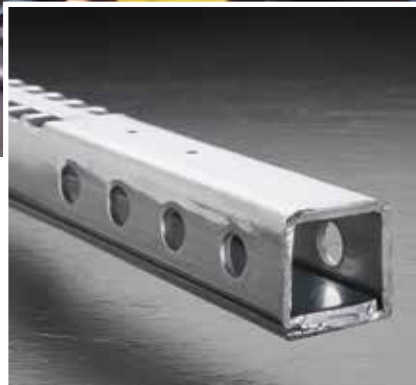
Closed square tube